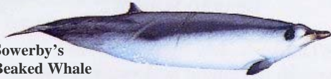
Sowerby's Beaked Whale

measurements, photographs and skin samples to be analysed by the Institute of Zoology. The dead calf was taken to the mainland for post-mortem tests at the Veterinary Laboratories Agency at Truro